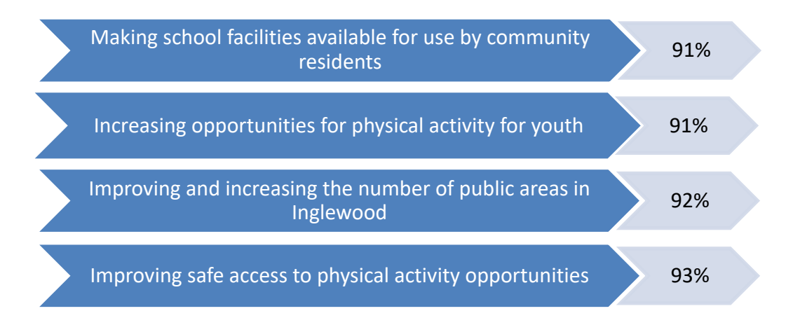
Figure 2. Percent of the sample that felt that improvement in these areas would help some, a fair amount, or great amount in regard to increasing physical activity, n=302

The vast majority of the sample felt that increasing access, increasing opportunities, and improving public spaces in Inglewood would help youth and their families be more physically active or exercise more (Figure 2). Most participants (90%) also felt that it was pretty or very important that residents of their community work together to make significant improvements to their community and make it a better place.